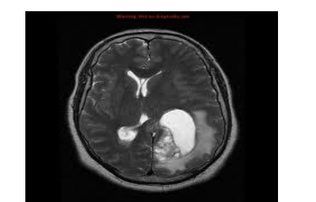
FIGURE (1) a. original image

A pixel becomes \begin{cases} white if its grey level is > T, \\ black if its grey level is \le T. \end{cases} Matrix is then transformed into image using 'imshow' command Below, in figure (1)